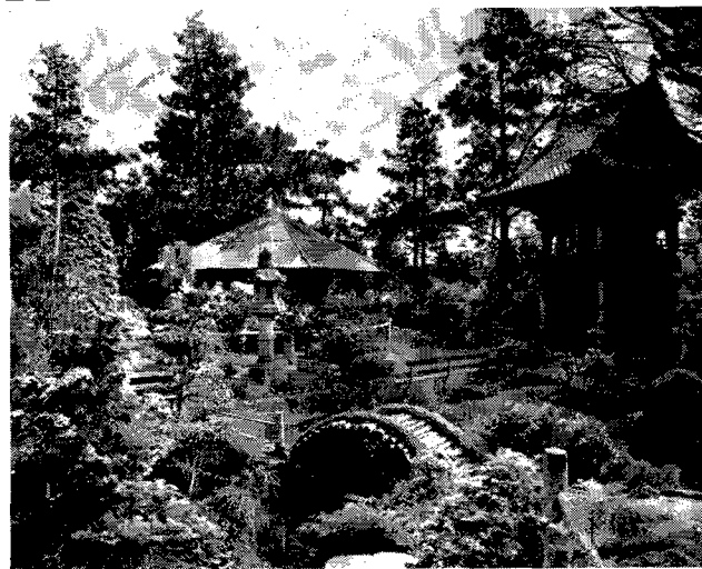
S.F. Convention Bureau